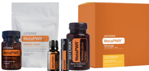
MetaPWR™ System launch date: October 1, 2022 (Convention Kits are available to attendees on Sept, 15, 2022)

Will your health-span be as long as your lifespan ?